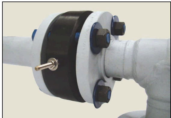
Flow Meter Instrument Flange installed below

For more information, please contact us at: