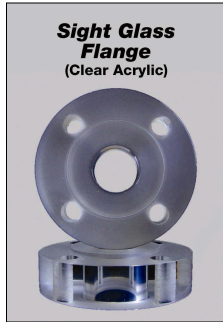
Sight glass flange in action