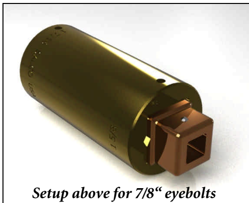
Setup above for 7/8" eyebolts