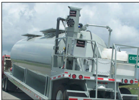
Available in portable and stationary models