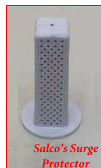
Available in Noryl, Ryton & Stainless Steel

If needed for your application, Salco can provide adapter flanges that allow the Quick Inspect to be mounted to your car in the field.